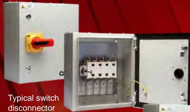
Typical switch disconnector exhibiting some of the design features shown in detail below.

Changeover Isolators are supplied fitted with 'piggy back' style interior switches giving more room for cable connections.