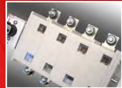
Positive contact indication through windows in switch body.