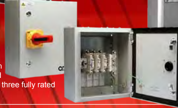
Fuse Combination Units are supplied fitted with a set of three fully rated fuse links.