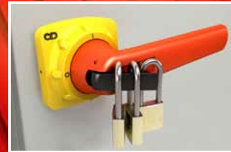
Door interlock handles with multi-padlock capacity & interlock override facility for test/emergency use.