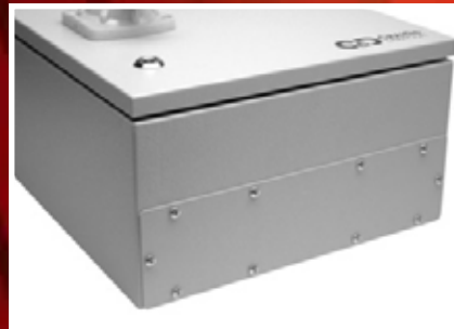
Removable gland plates fitted to top & bottom of enclosure.