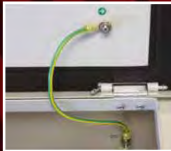
Earth bonding between lid & enclosure base