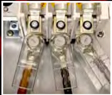
Individual terminal shields that follow the displacement of the connecting cables.