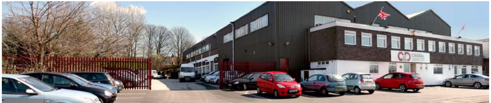
Craig & Derricott's U.K. headquarters