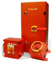
C&D Fire Rated Switches

For more information on our fire rated switches click this link.