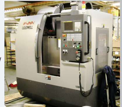
New CNC Machine installed in the C&D factory.

C&D continue to invest in UK manufacturing by installing a new CNC Machine. The new machine will enable C&D to manufacture low volume special parts for transport projects and parts that can no longer be obtained from current suppliers;