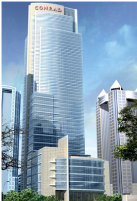
PPM Conrad Hotel - Dubai

C&D won a prestigious contract to supply 200 Fire Rated Isolators for the prestigious PPM Conrad Hotel in Dubai (Pictured below). The isolators were installed in the several floors of underground hotel car park, and comply with the stringent requirements of BS EN 12101-2003 and in the event of a fire are used to maintain the power to the extraction fans