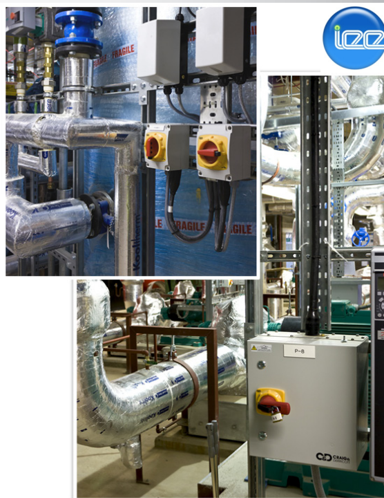
Application shot: 25A Moulded Switch and 125A Hinged Door Switch installed by Integrated Electrical at a construction site in the UK.

and lockable handle; to access the unit the isolator has to be switched off and a key is required to unlock the door making it very secure. In terms of installation, the unit was easy to mount, with securing holes located for simple access for any tools required